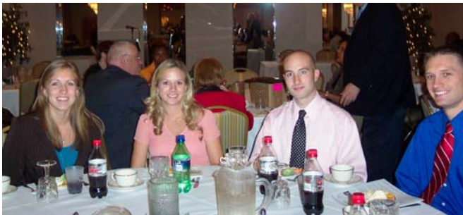
Audience members eagerly await the speaker's arrival

One aspect of her job that Ms. Barnhart values is that she has a job where she is responsible for helping people. Besides the IRS, SSA is pretty much the only Federal agency that the public will come face to face with. Ms. Barnhart is proud of the fact that during the time that SSA has been in existence, poverty among the elderly has decreased by thirty-three percent. ❖