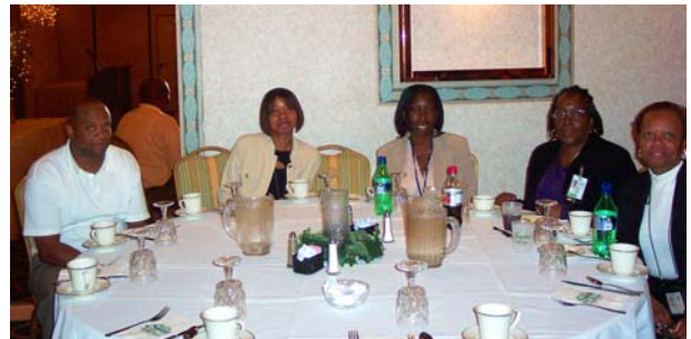
Audience members network before the training