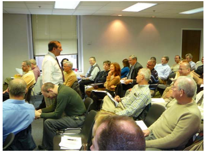
Four hours later and everyone is still awake and taking Notes