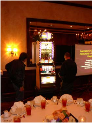
Setting up before the luncheon