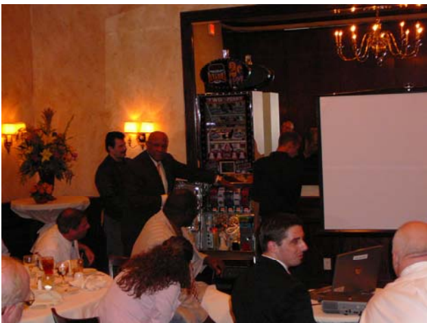
Inside the slot machine