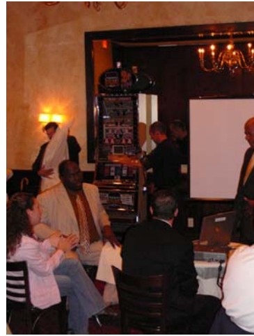
The long awaited unveiling