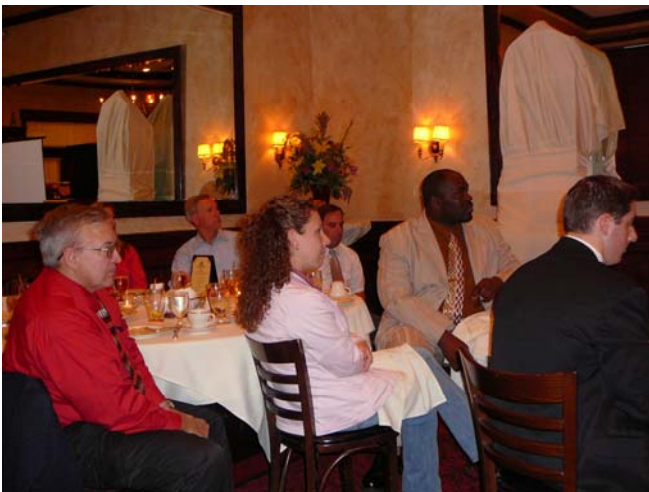
Members picking up tips