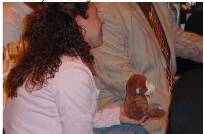
Passing the monkey