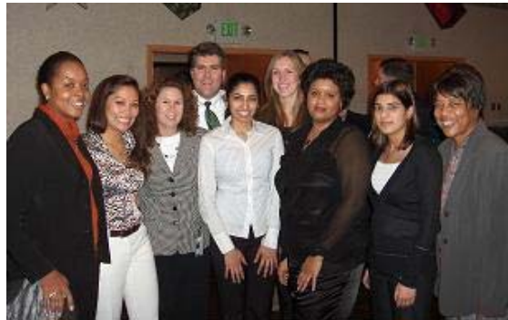
Baltimore Chapter Members stop for a picture during the break